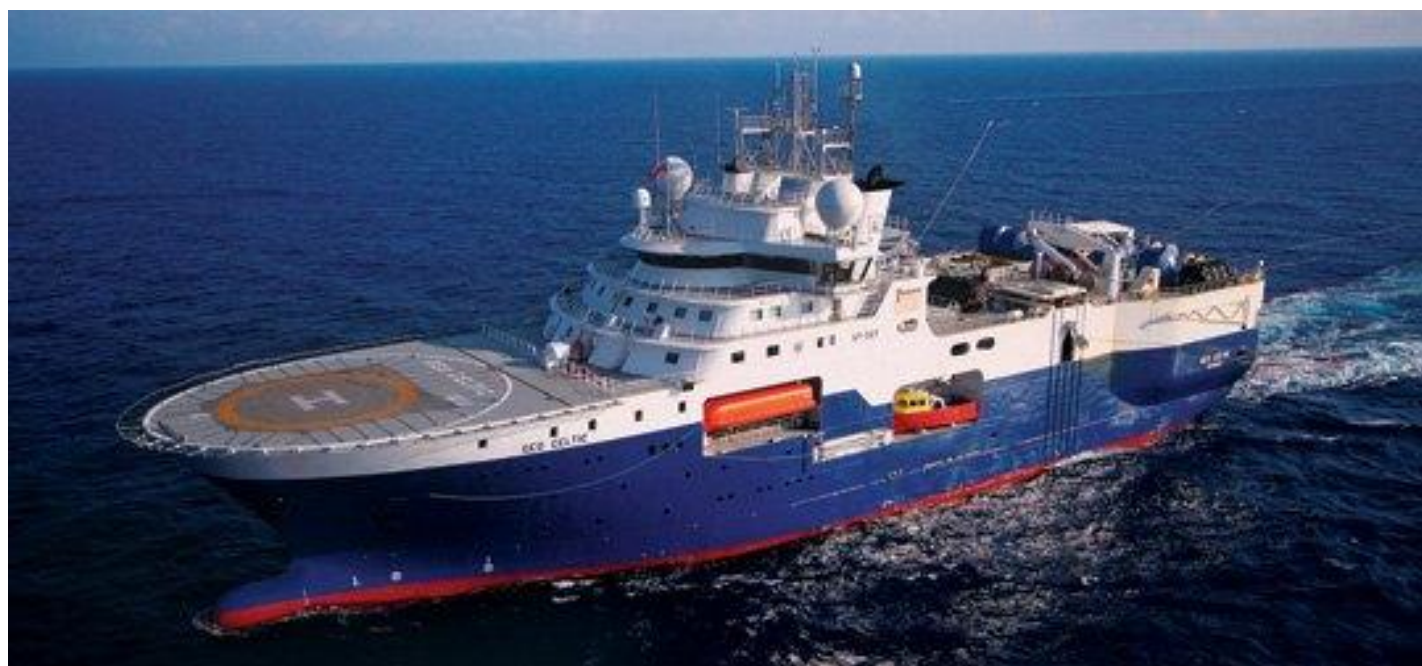
Figure 2: The Fugro-Geoteam seismic vessel, Geo Celtic.

The seismic data are being acquired using Fugro's Geo Celtic (Figure 2). This purpose-build seismic vessel is one of the world's largest and incorporates state-of-the-art technology including up to 12 fully-steerable, 8,000-metre-long, solid streamers.